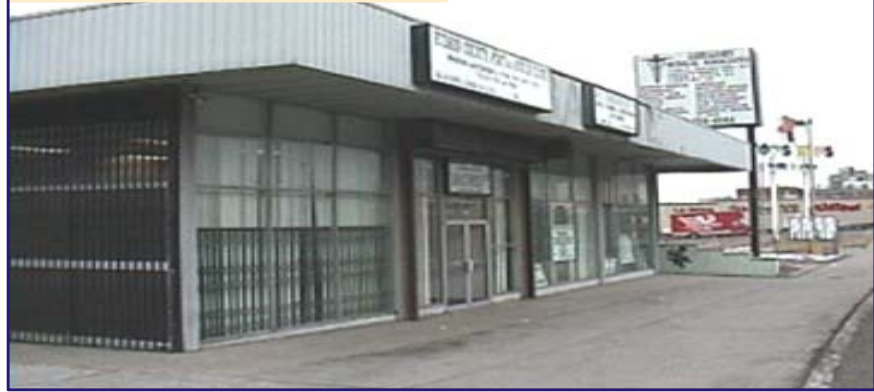
LOOKING NORTHWEST FROM KENNEDY BLVD